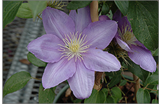
Cezanne Clematis flowers