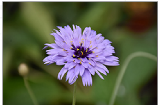
Cupid's Dart flowers