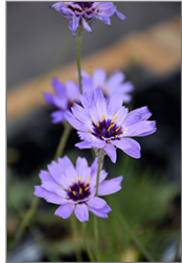
Cupid's Dart flowers

This is a relatively low maintenance plant, and is best cleaned up in early spring before it resumes active growth for the season. It is a good choice for attracting birds, bees and butterflies to your yard. It has no significant negative characteristics.