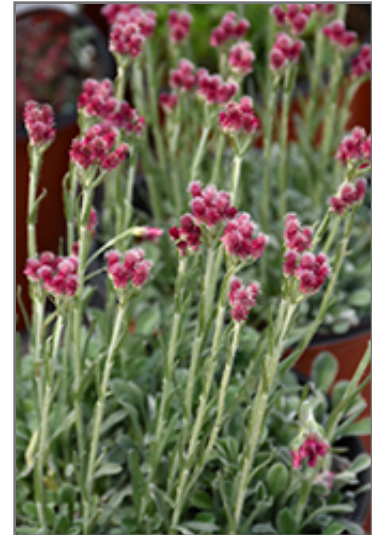
Red Pussytoes flowers

Red Pussytoes is recommended for the following landscape applications;