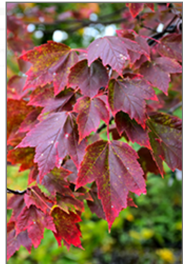
Red Sunset Red Maple in fall