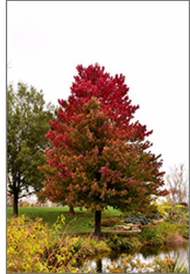
Red Sunset Red Maple in fall

Red Sunset Red Maple is recommended for the following landscape applications;