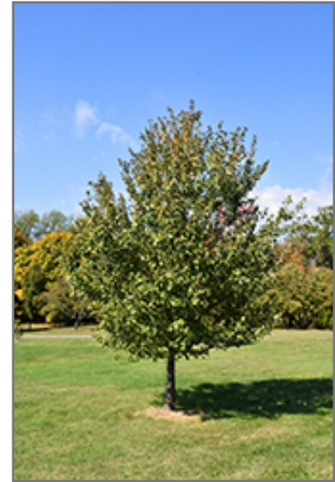
Red Sunset Red Maple

This tree should only be grown in full sunlight. It is quite adaptable, preferring to grow in average to wet conditions, and will even tolerate some standing water. It is not particular as to soil type, but has a definite preference for acidic soils, and is subject to chlorosis (yellowing) of the foliage in alkaline soils. It is somewhat tolerant of urban pollution. This is a selection of a native North American species.