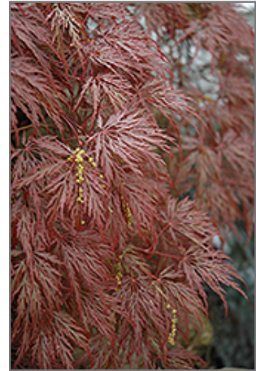
Inaba Shidare Cutleaf Japanese Maple foliage

This is a relatively low maintenance tree, and should only be pruned in summer after the leaves have fully developed, as it may 'bleed' sap if pruned in late winter or early spring. It has no significant negative characteristics.