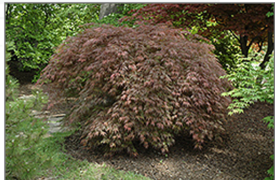
Inaba Shidare Cutleaf Japanese Maple