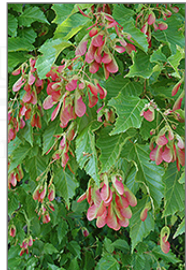
Amur Maple (multi-stem) fruit