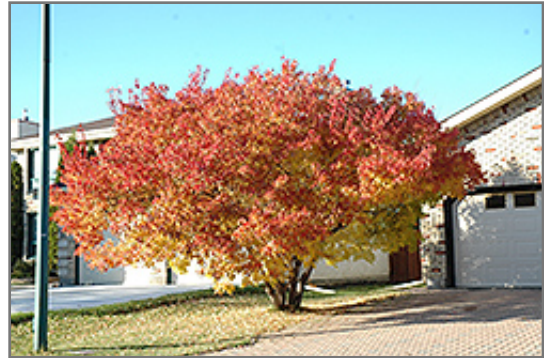
Amur Maple (multi-stem) in fall

Amur Maple (multi-stem) is recommended for the following landscape applications;