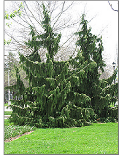
Nootka Cypress

Nootka Cypress is recommended for the following landscape applications;