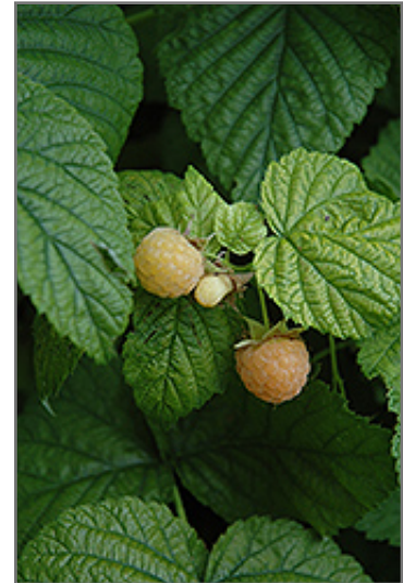
Fall Gold Raspberry fruit

Fall Gold Raspberry has rich green deciduous foliage on a plant with an upright spreading habit of growth. The fuzzy oval compound leaves do not develop any appreciable fall colour. It features an abundance of magnificent gold berries with yellow overtones from early summer to early fall.