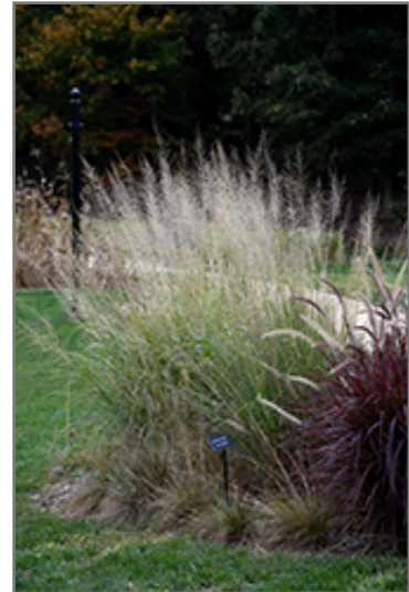
Prairie Dropseed fruit

This plant does best in full sun to partial shade. It is very adaptable to both dry and moist locations, and should do just fine under typical garden conditions. It is considered to be drought-tolerant, and thus makes an ideal choice for a low-water garden or xeriscape application. It is not particular as to soil type or pH, and is able to handle environmental salt. It is somewhat tolerant of urban pollution. This species is native to parts of North America.