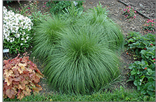
Prairie Dropseed

Prairie Dropseed is an open herbaceous perennial with a shapely form and gracefully arching foliage. It brings an extremely fine and delicate texture to the garden composition and should be used to full effect.