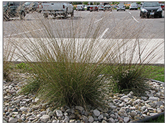
Prairie Dropseed