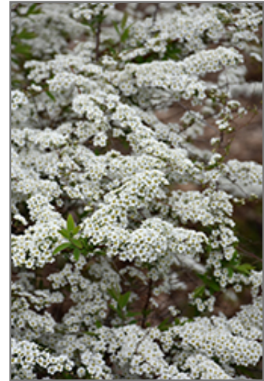
Grefsheim Spirea flowers

Grefsheim Spirea is recommended for the following landscape applications;