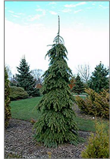
Weeping White Spruce