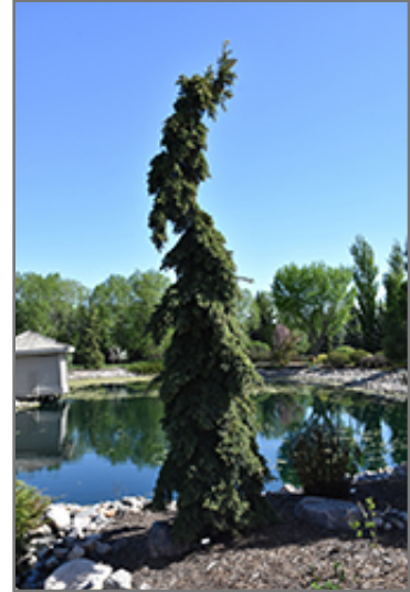
Weeping White Spruce

This tree does best in full sun to partial shade. It prefers to grow in average to moist conditions, and shouldn't be allowed to dry out. It is not particular as to soil type or pH. It is somewhat tolerant of urban pollution, and will benefit from being planted in a relatively sheltered location. This is a selection of a native North American species.