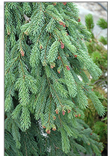
Weeping White Spruce foliage