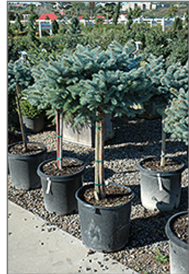
Globe Blue Spruce (tree form)