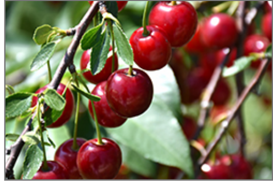
Romeo Cherry fruit