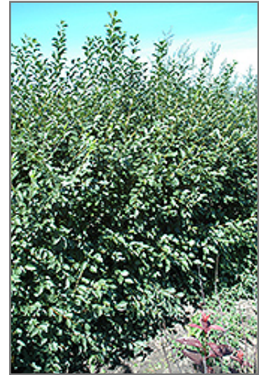
Romeo Cherry

This shrub is typically grown in a designated area of the yard because of its mature size and spread. It should only be grown in full sunlight. It does best in average to evenly moist conditions, but will not tolerate standing water. It is not particular as to soil type or pH. It is highly tolerant of urban pollution and will even thrive in inner city environments. This particular variety is an interspecific hybrid.