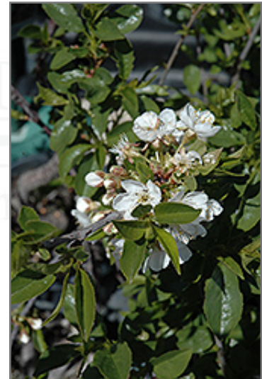
Romeo Cherry flowers