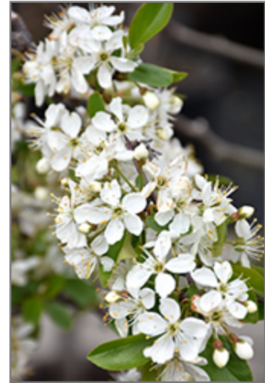
Valentine Cherry flowers

This shrub is typically grown in a designated area of the yard because of its mature size and spread. It should only be grown in full sunlight. It does best in average to evenly moist conditions, but will not tolerate standing water. It is not particular as to soil type or pH. It is highly tolerant of urban pollution and will even thrive in inner city environments. This particular variety is an interspecific hybrid.