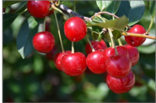
Valentine Cherry fruit