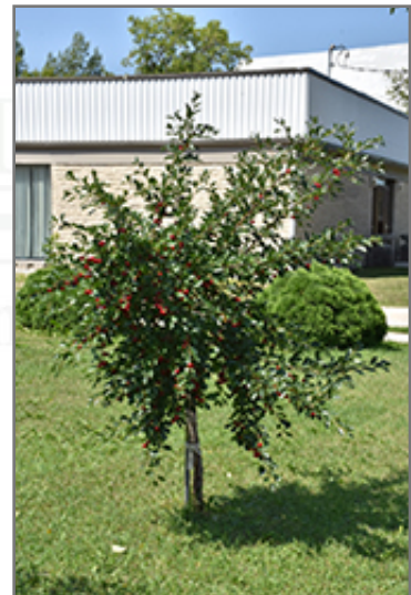
Valentine Cherry fruit