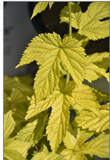
Golden Hops foliage