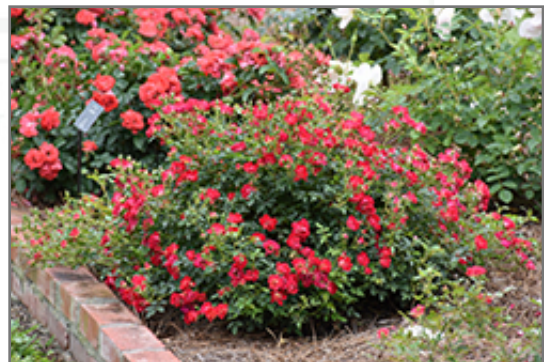
Red Drift Rose in bloom