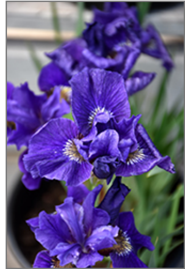
Ruffled Velvet Iris flowers

This plant will require occasional maintenance and upkeep, and should be cut back in late fall in preparation for winter. Deer don't particularly care for this plant and will usually leave it alone in favor of tastier treats. It has no significant negative characteristics.