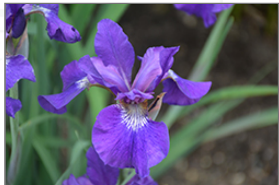
Ruffled Velvet Iris flowers