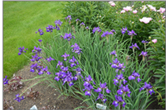
Ruffled Velvet Iris in bloom

Ruffled Velvet Iris will grow to be about 24 inches tall at maturity extending to 3 feet tall with the flowers, with a spread of 18 inches. When grown in masses or used as a bedding plant, individual plants should be spaced approximately 14 inches apart. It grows at a medium rate, and under ideal conditions can be expected to live for approximately 10 years. As an herbaceous perennial, this plant will usually die back to the crown each winter, and will regrow from the base each spring. Be careful not to disturb the crown in late winter when it may not be readily seen!