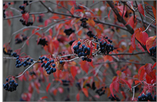
Nannyberry fruit