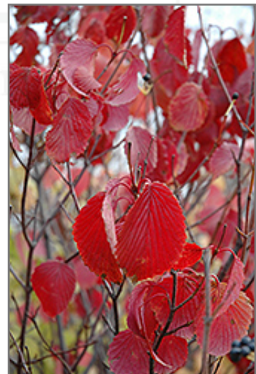
Arrowwood in fall