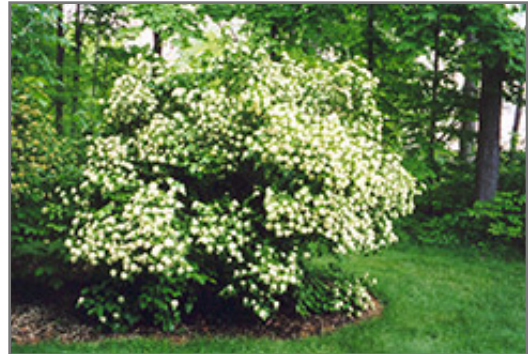
Arrowwood in bloom

Arrowwood will grow to be about 10 feet tall at maturity, with a spread of 8 feet. It tends to be a little leggy, with a typical clearance of 2 feet from the ground, and is suitable for planting under power lines. It grows at a medium rate, and under ideal conditions can be expected to live for 40 years or more.