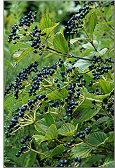
Arrowwood fruit

This is a relatively low maintenance shrub, and should only be pruned after flowering to avoid removing any of the current season's flowers. It is a good choice for attracting birds to your yard, but is not particularly attractive to deer who tend to leave it alone in favor of tastier treats. It has no significant negative characteristics.