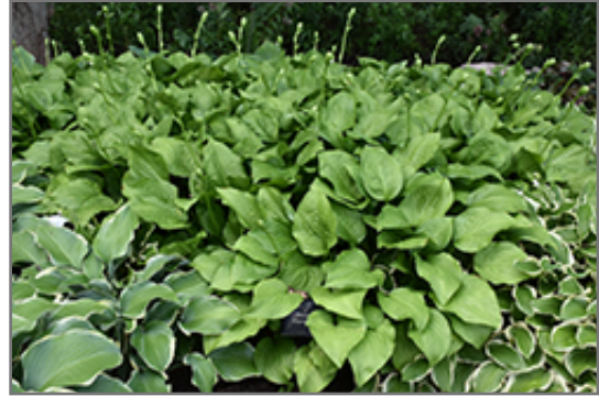
Royal Standard Hosta

This is a relatively low maintenance plant, and is best cleaned up in early spring before it resumes active growth for the season. Gardeners should be aware of the following characteristic(s) that may warrant special consideration;