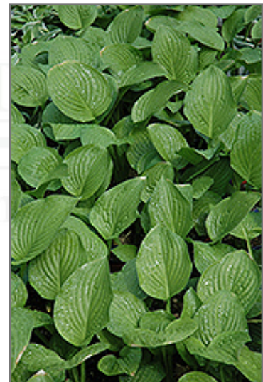
Royal Standard Hosta foliage