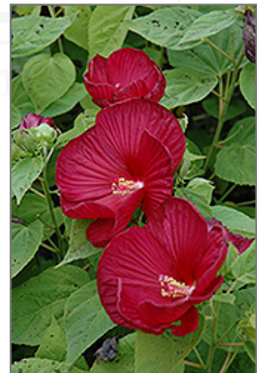
Luna Red Hibiscus flowers