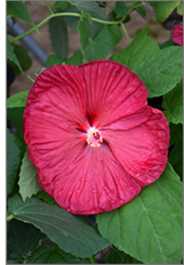
Luna Red Hibiscus flowers

This plant will require occasional maintenance and upkeep, and should be cut back in late fall in preparation for winter. It is a good choice for attracting butterflies and hummingbirds to your yard. Gardeners should be aware of the following characteristic(s) that may warrant special consideration;