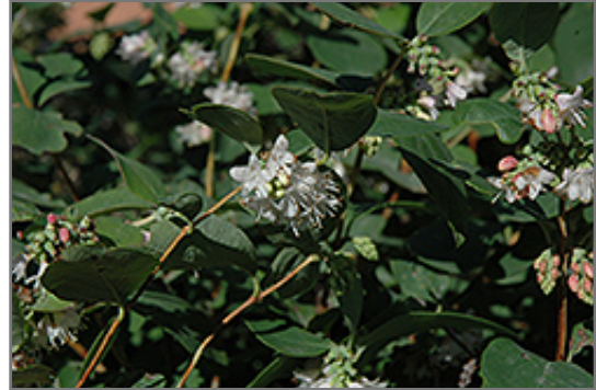
Snowberry flowers

This shrub performs well in both full sun and full shade. It is very adaptable to both dry and moist locations, and should do just fine under average home landscape conditions. It is not particular as to soil type or pH. It is somewhat tolerant of urban pollution. This species is native to parts of North America.