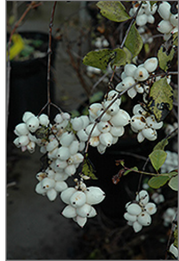
Snowberry fruit