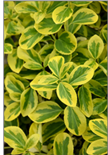
Gold Splash Wintercreeper foliage