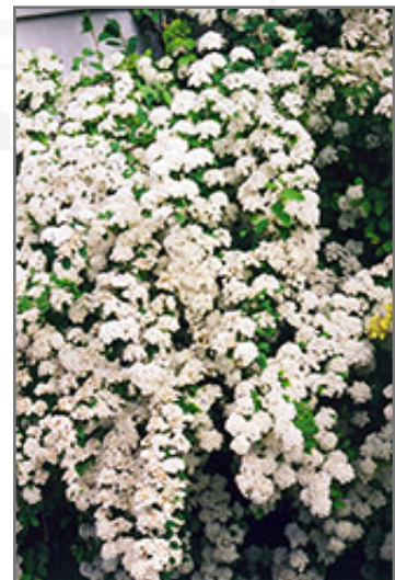
Vanhoutte Spirea flowers