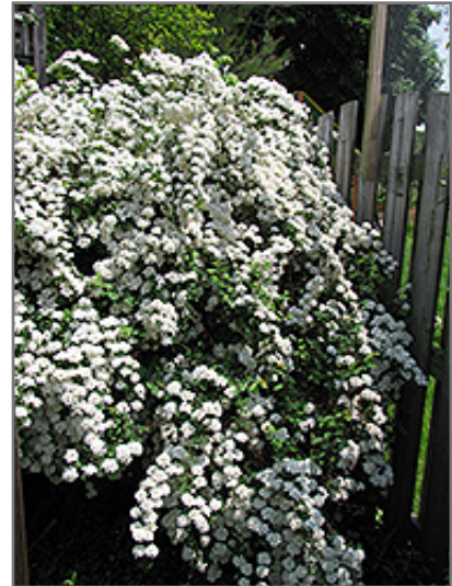
Vanhoutte Spirea in bloom