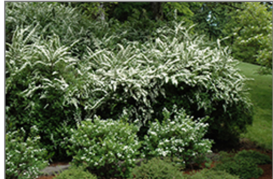
Snowmound Spirea in bloom

Snowmound Spirea is recommended for the following landscape applications;