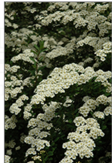
Snowmound Spirea flowers