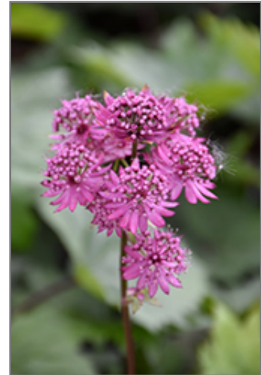
Star Of Beauty Masterwort flowers

Star Of Beauty Masterwort is recommended for the following landscape applications;