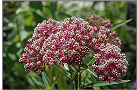
Cinderella Milkweed flowers

This is a relatively low maintenance plant, and is best cleaned up in early spring before it resumes active growth for the season. It is a good choice for attracting butterflies to your yard, but is not particularly attractive to deer who tend to leave it alone in favor of tastier treats. It has no significant negative characteristics.