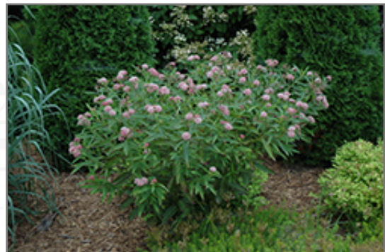
Cinderella Milkweed in bloom