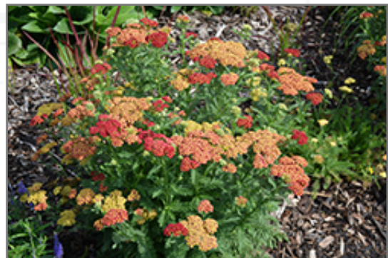
Strawberry Seduction Yarrow in bloom