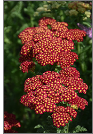
Strawberry Seduction Yarrow flowers

This is a high maintenance plant that will require regular care and upkeep, and is best cleaned up in early spring before it resumes active growth for the season. It is a good choice for attracting bees, butterflies and hummingbirds to your yard, but is not particularly attractive to deer who tend to leave it alone in favor of tastier treats. Gardeners should be aware of the following characteristic(s) that may warrant special consideration;