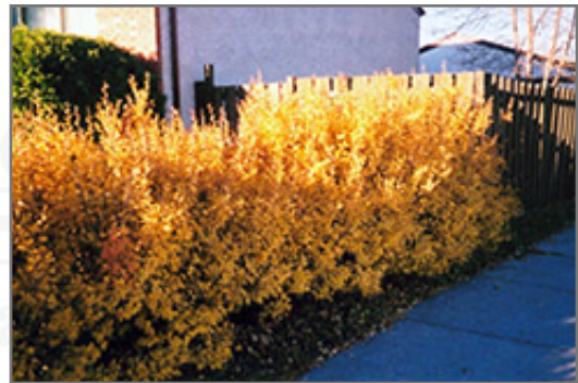
Alpine Currant in fall