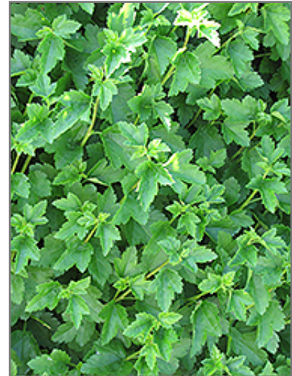
Alpine Currant foliage

This shrub performs well in both full sun and full shade. It is very adaptable to both dry and moist locations, and should do just fine under average home landscape conditions. It is considered to be drought-tolerant, and thus makes an ideal choice for xeriscaping or the moisture-conserving landscape. It is not particular as to soil type or pH. It is highly tolerant of urban pollution and will even thrive in inner city environments. This species is not originally from North America.