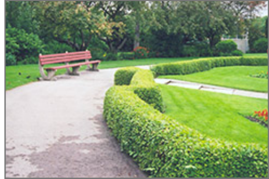
Alpine Currant

Alpine Currant is recommended for the following landscape applications;