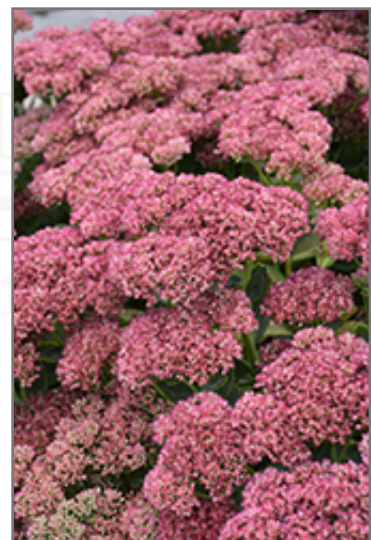
Autumn Fire Stonecrop flowers