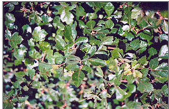
Fragrant Sumac foliage