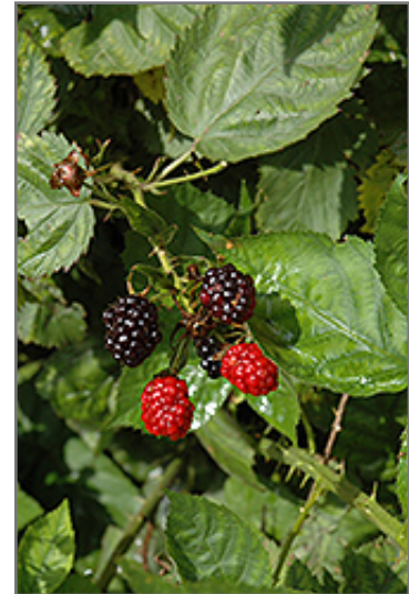
Illini Hardy Blackberry fruit

Illini Hardy Blackberry has rich green deciduous foliage on a plant with an upright spreading habit of growth. The fuzzy oval compound leaves do not develop any appreciable fall colour. It features an abundance of magnificent black berries in mid summer.