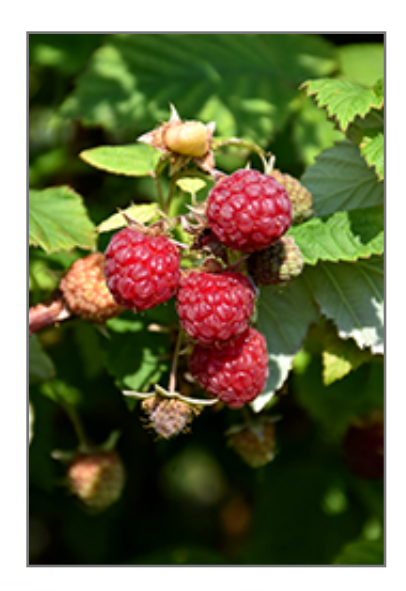
Boyne Raspberry fruit

Boyne Raspberry has rich green deciduous foliage on a plant with an upright spreading habit of growth. The fuzzy oval compound leaves do not develop any appreciable fall colour. It features an abundance of magnificent red berries in mid summer.