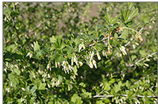
Pixwell Gooseberry flowers