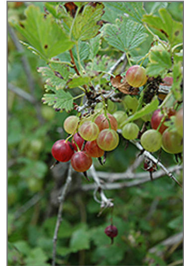
Pixwell Gooseberry fruit

Pixwell Gooseberry has rich green deciduous foliage on a plant with an upright spreading habit of growth. The lobed leaves turn yellow in fall. It features an abundance of magnificent chartreuse berries with salmon blush in early summer.