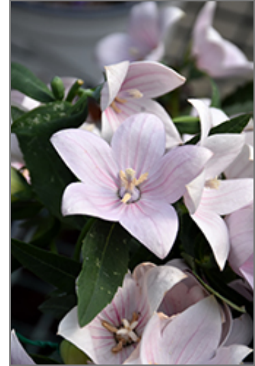
Fuji Pink Balloon Flower flowers

Fuji Pink Balloon Flower has masses of beautiful spikes of shell pink bell-shaped flowers with creamy white eyes and silver veins rising above the foliage from late spring to mid summer, which are most effective when planted in groupings. The flowers are excellent for cutting. Its narrow leaves remain dark green in colour throughout the season.