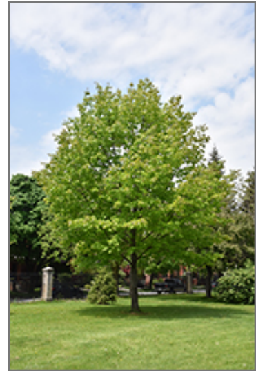
Red Oak