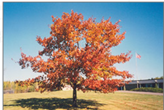
Red Oak in fall