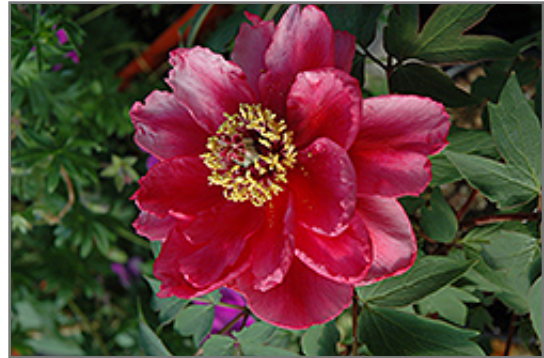
Shimanishiki Tree Peony flowers

Height: 4 feet Spread: 3 feet Sunlight: ☉ ● Hardiness Zone: 4a