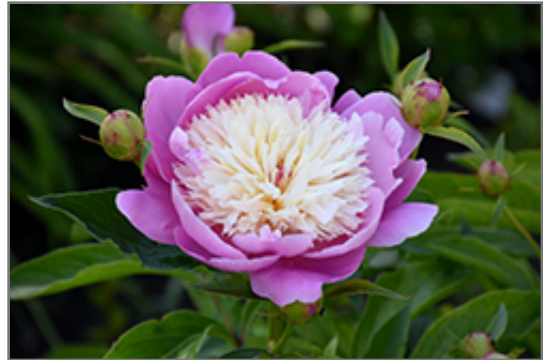
Bowl Of Beauty Peony flowers