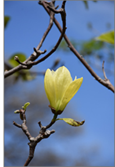
Butterflies Magnolia flowers

Butterflies Magnolia will grow to be about 20 feet tall at maturity, with a spread of 18 feet. It has a low canopy with a typical clearance of 2 feet from the ground, and is suitable for planting under power lines. It grows at a medium rate, and under ideal conditions can be expected to live for 50 years or more.