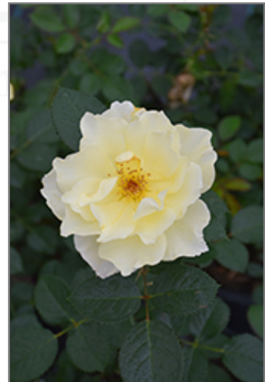
Yukon Sun Rose flowers