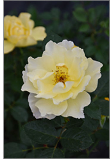
Yukon Sun Rose flowers