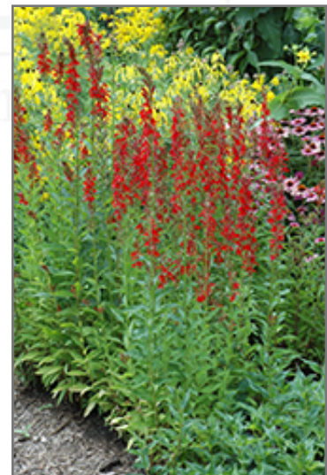
Cardinal Flower in bloom