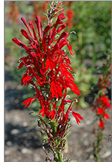
Cardinal Flower flowers