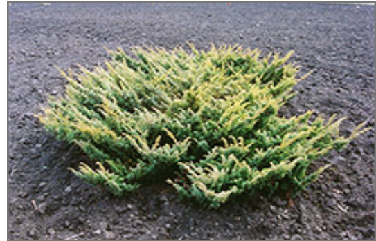
Japanese Garden Juniper