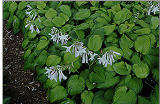
Guacamole Hosta in bloom