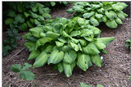
Guacamole Hosta