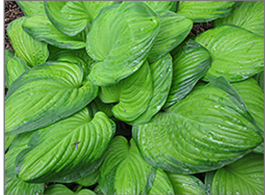
Guacamole Hosta foliage

Guacamole Hosta is a dense herbaceous perennial with tall flower stalks held atop a low mound of foliage. Its relatively coarse texture can be used to stand it apart from other garden plants with finer foliage.