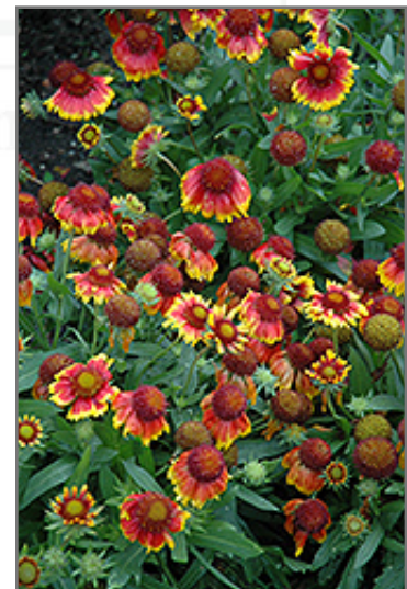
Arizona Sun Blanket Flower flowers