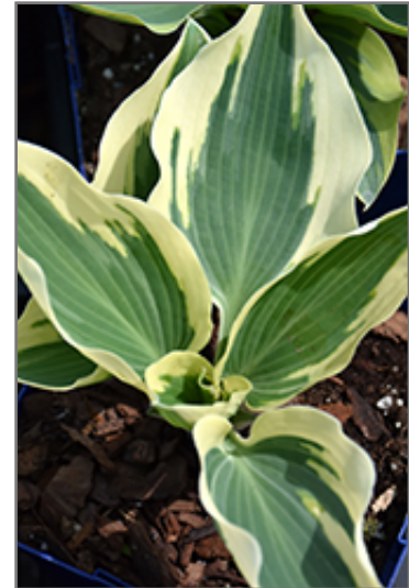
Firn Line Hosta

Firn Line Hosta is recommended for the following landscape applications;