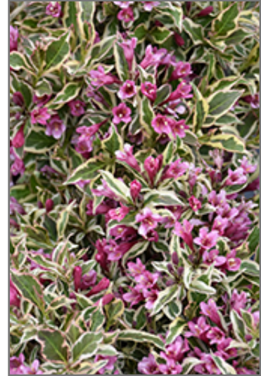
My Monet Purple Effect Weigela flowers

My Monet Purple Effect Weigela is recommended for the following landscape applications;