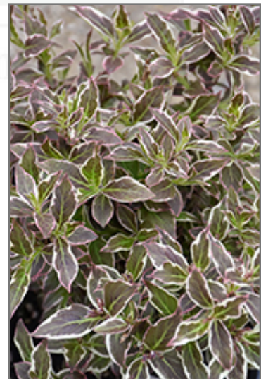
My Monet Purple Effect Weigela foliage