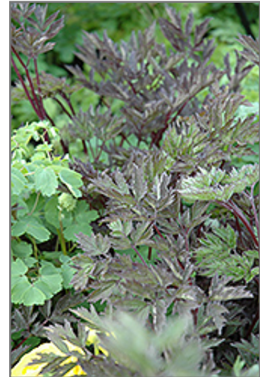
Hillside Black Beauty Bugbane

Hillside Black Beauty Bugbane is recommended for the following landscape applications;