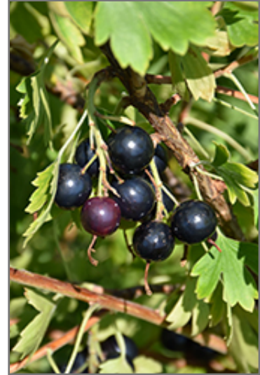
Crandall Clove Currant fruit