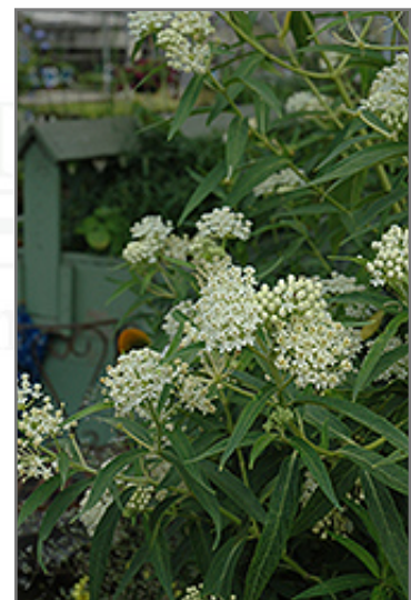
Ice Ballet Milkweed flowers