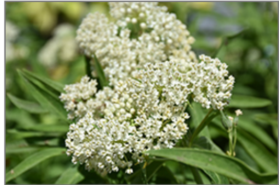
Ice Ballet Milkweed flowers

This is a relatively low maintenance plant, and is best cleaned up in early spring before it resumes active growth for the season. It is a good choice for attracting butterflies to your yard, but is not particularly attractive to deer who tend to leave it alone in favor of tastier treats. It has no significant negative characteristics.