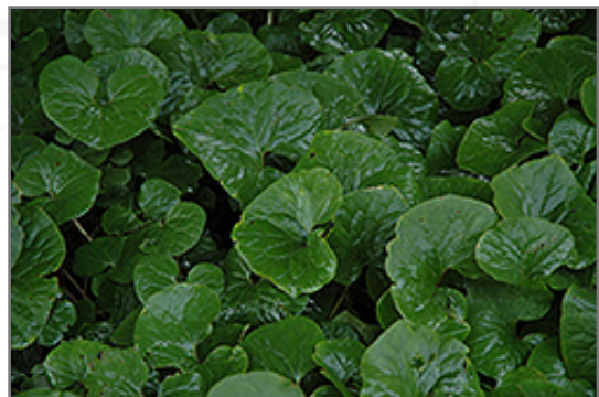
Canadian Wild Ginger